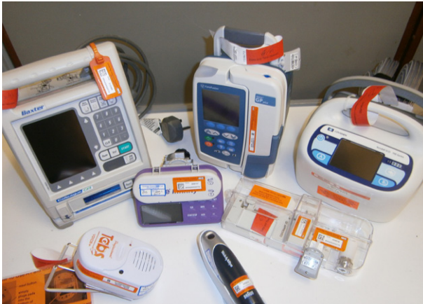
Medical devices with GS1 compliant asset labels

The unique identification of each medical device with their new GS1 compliant asset labels puts CUH firmly on the route to scanning for safety. This means equipment can be scanned against a patient's wristband to identify which exact device is used for the patient.