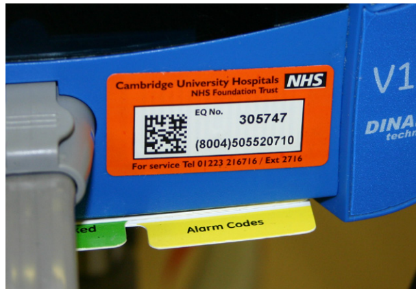
GS1 compliant asset label